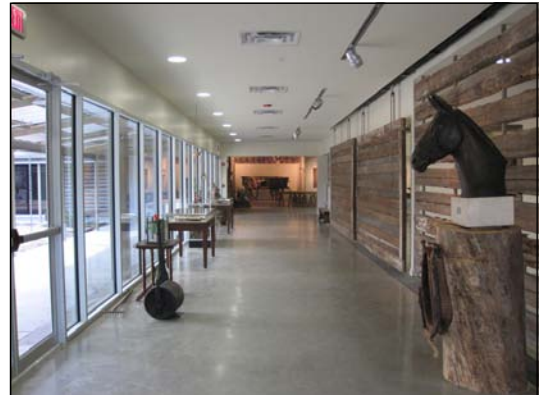
RURAL LIFE MUSEUM

General Contractor, Cangelosi Ward completed the expansion of the Visitor's Center for the Rural Life Museum, located on the Burden Plantation off Essen Lane in Baton Rouge. The $4,436,800 project includes 22,775 SF of new building area and 16,115 SF of renovated space. The renovated Visitor's Center is anchored by a central courtyard containing 19th century Louisiana artifacts.