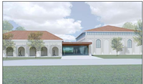
NEW BAND HALL

Construction drawings for the new Band Hall were released for bid this month. The estimated cost of construction is $8,300,000. The 19,500 SF building will be used primarily by the marching band, but will include shared spaces to be used by other LSU bands. The complex will include an observation tower overlooking the band practice fields along Aster Drive. The project is scheduled for completion in early 2012.