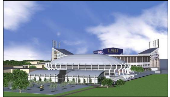
PMAC BASKETBALL PRACTICE FACILITY

General Contractor, Guy Hopkins Construction, is wrapping up the construction of the new $14,000,000 basketball practice facility adjacent to the Pete Maravich Assembly Center. The 58,960 SF facility features two 11,000 SF practice gyms, new locker rooms, and administrative and training space for the men's and women's basketball programs. The new building is located on the north side of the existing PMAC and connects at the lower and concourse levels to the existing building.