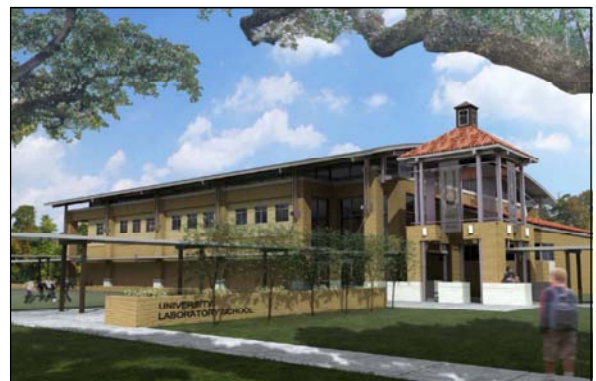
LAB SCHOOL-NEW GYM

Buquet & LeBlanc submitted a low bid of $3,915,000 for the New Gymnasium to be built on the University Lab School campus. The 15,000 SF facility will sit on the northern edge of the Lab School athletic fields, facing East Campus Drive. The project will incorporate several sustainable initiatives, including progressive waste management strategies, which include the sorting and recycling of construction debris. The building is scheduled to open in Fall 2011.